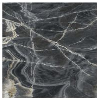
Glossy ceramic Black Onyx