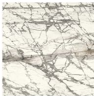
Glossy ceramic Imperial grey