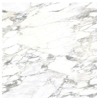
Glossy ceramic Calacatta