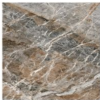
Glossy ceramic Mountain peak