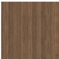
Solid wood Walnut Canaletto