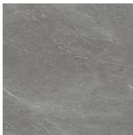
Mat ceramic Ardesia grey