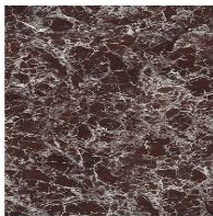
Glossy ceramic Rosso imperiale

Materials, fabrics, leathers, colors and finishes are approximate and may slightly differ from actual ones. You can find the complete collection of Bonaldo fabrics and leathers on the website