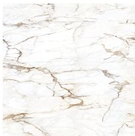
Silk finish ceramic Calacatta macchia vecchia