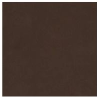
Painted metal Mat bronze