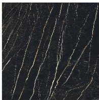
Mat ceramic Laurent